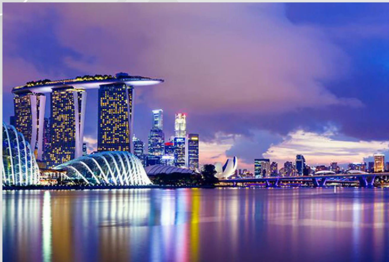
Singapore Skyline at night