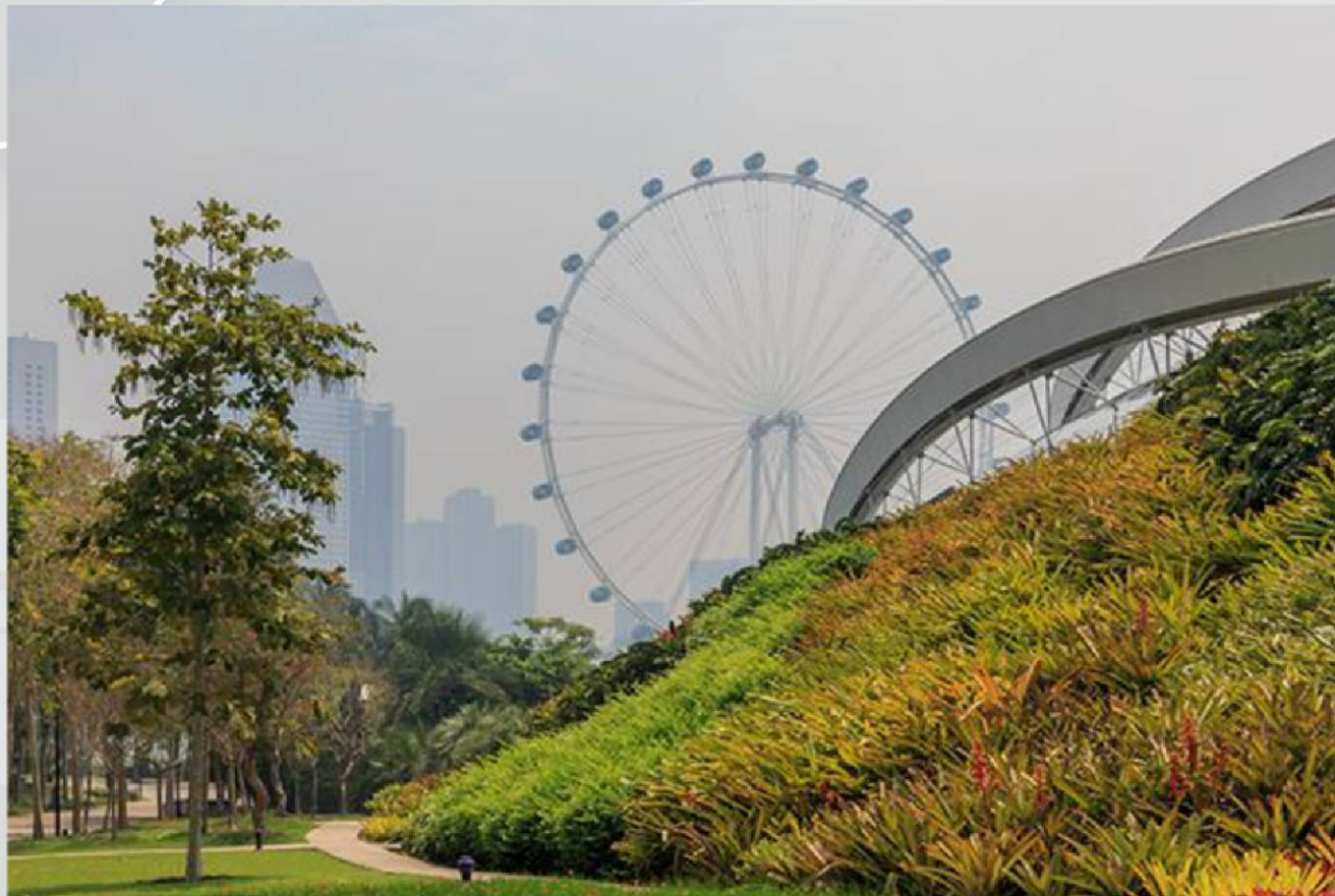
Ferris Wheel seen from the Gardens By the Bay

The convention general sessions will be held at the Singapore National Stadium, which has the biggest retractable dome in the world. The House of Friendship and all the breakout sessions will take place at the famous Marina Bay Sands.